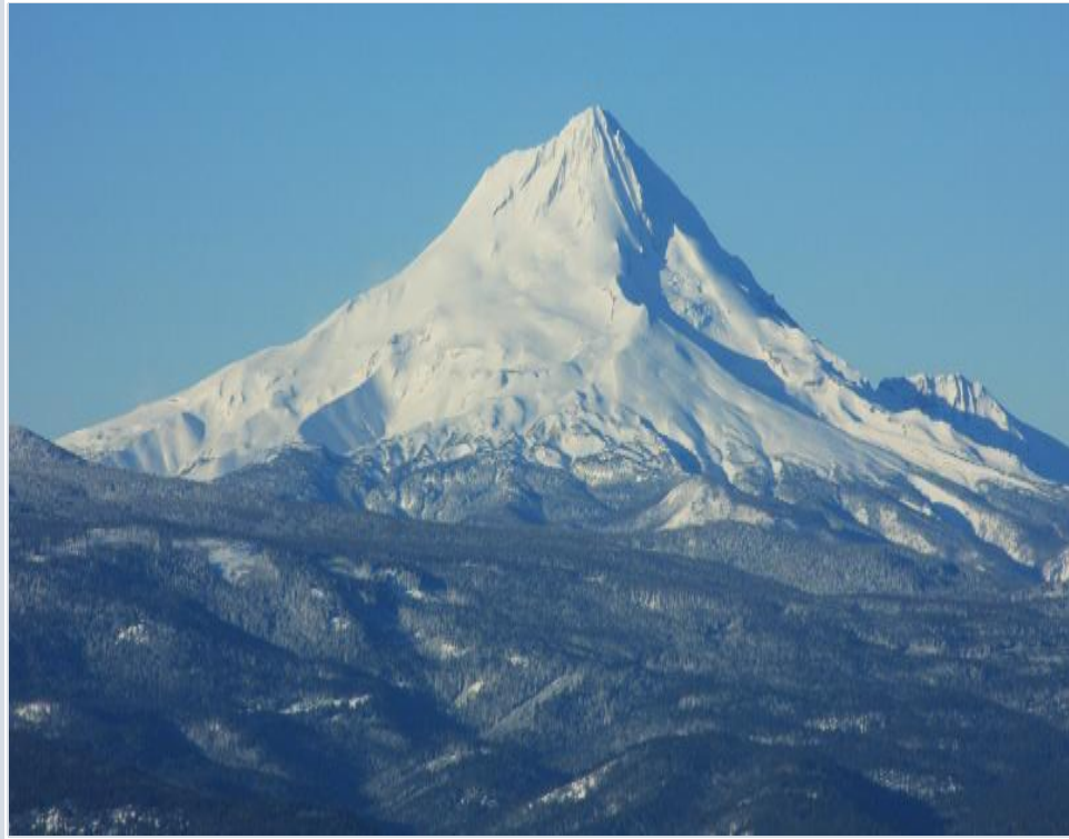
Mount Hood, OR leaving Columbia River Gorge (Dallesport, WA airport) Dec 30, 2010 from C-120