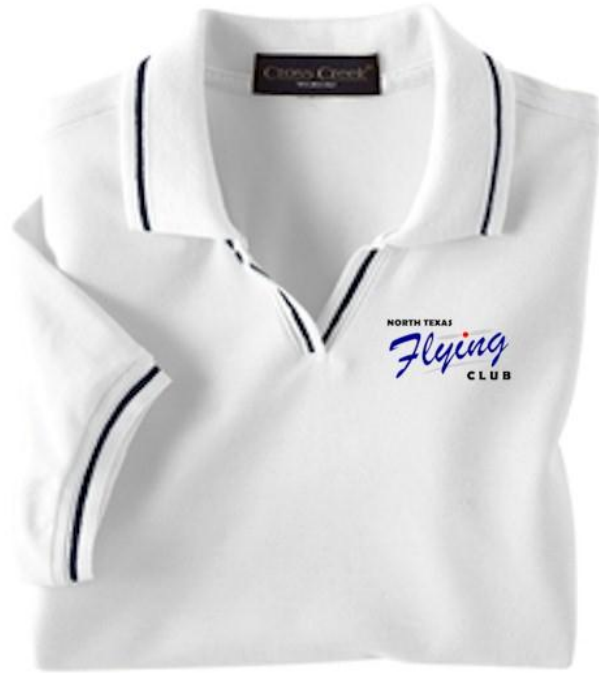
Ladies' Sport Shirt - White