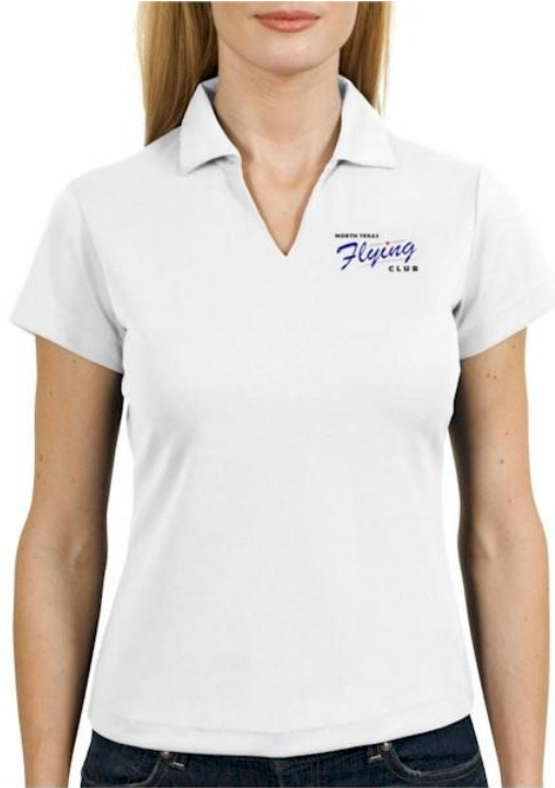
Ladies' Sport Shirt - White