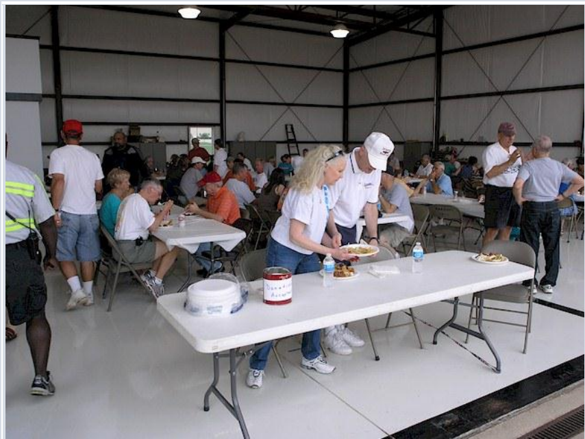
EAA Fish Fry 2011

EAA Chapter 1246 will have their annual fish fry on April 21 at the MHOA hangars. Come enjoy the fried fish, hush puppies, fries, slaw, beans and more. Starting at 11:00 am.