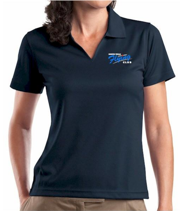
Ladies Sport Shirt - Navy