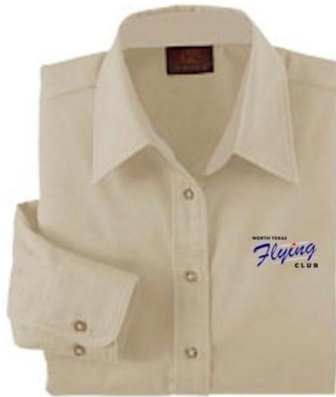
Ladies' LS Twill - Stone