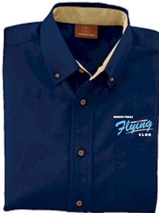
Men's LS Twill - Navy