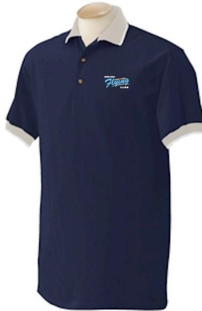
Men's Polo Shirt - Navy