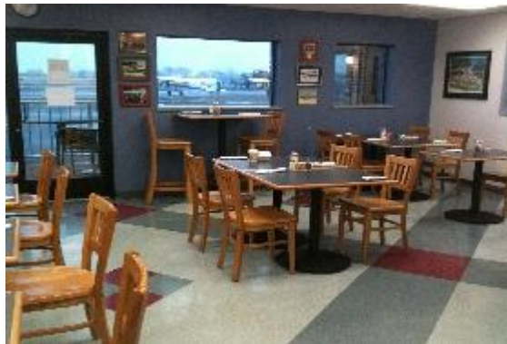
Lancaster Airport, Lancaster, TX (KLNC) -- Runway Cafe. Great burgers, friendly staff, and nice little airport.