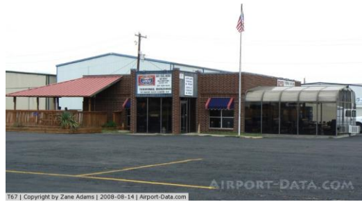
Hicks Field Ft. Worth, TX (T67) -- Rio Concho Cafe. Open Tuesday - Saturday, 11AM - 2PM, and Sundays 8AM - 3PM.