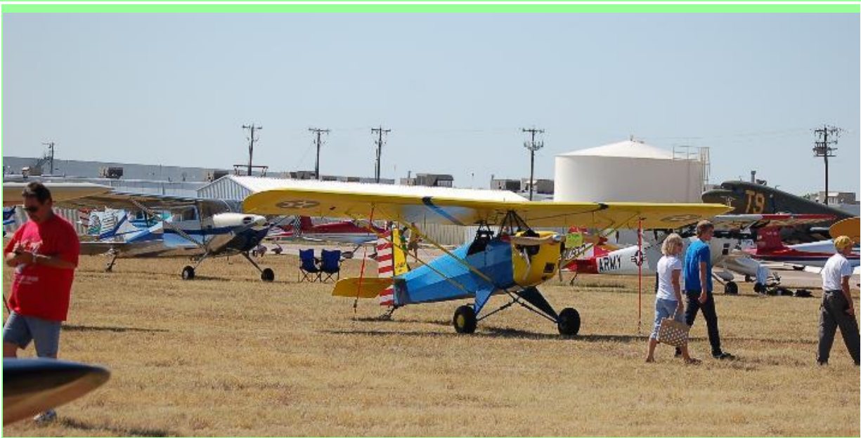
Gainesville Fly In October 2011