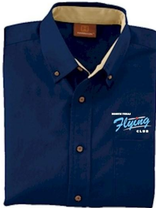
Men's LS Twill - Navy