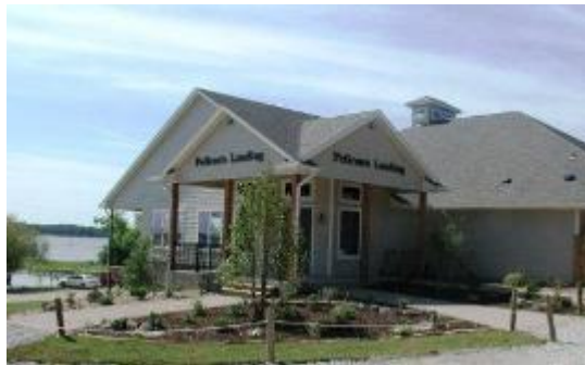
Cedar Mills Airport, on Lake Texoma (3T0) -- Pelican's Landing Waterfront Restaurant. Land on the beautiful grass strip and walk a short distance to the restaurant and marina.