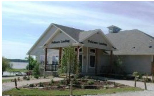
Cedar Mills Airport, on Lake Texoma (3T0) -- Pelican's Landing Waterfront Restaurant. Land on the beautiful grass strip and walk a short distance to the restaurant and marina.