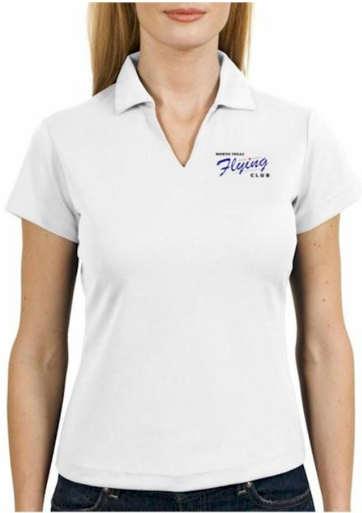
Ladies' Sport Shirt - White