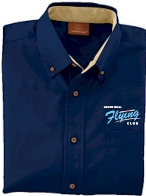
Men's LS Twill - Navy