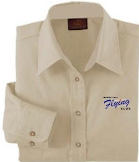
Ladies' LS Twill - Stone