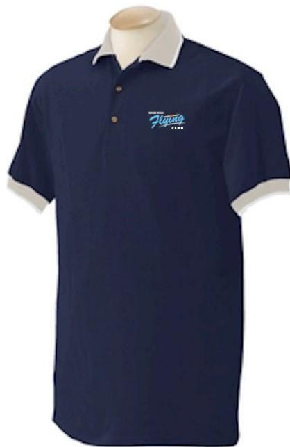
Men's Polo Shirt - Navy